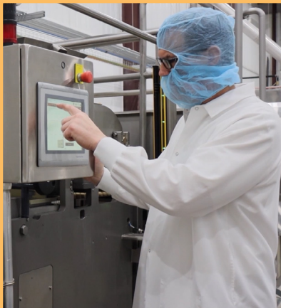
RBSConnect control panel

That same partnership mindset guided ZoRoCo's decision to work with Partake during its early stages. Inspired by founder Denise Woodard's mission to create safe, allergen-free cookies for her daughter and others with food allergies, ZoRoCo took a chance on the brand, supporting its growth from startup to a now nationally recognized product line.